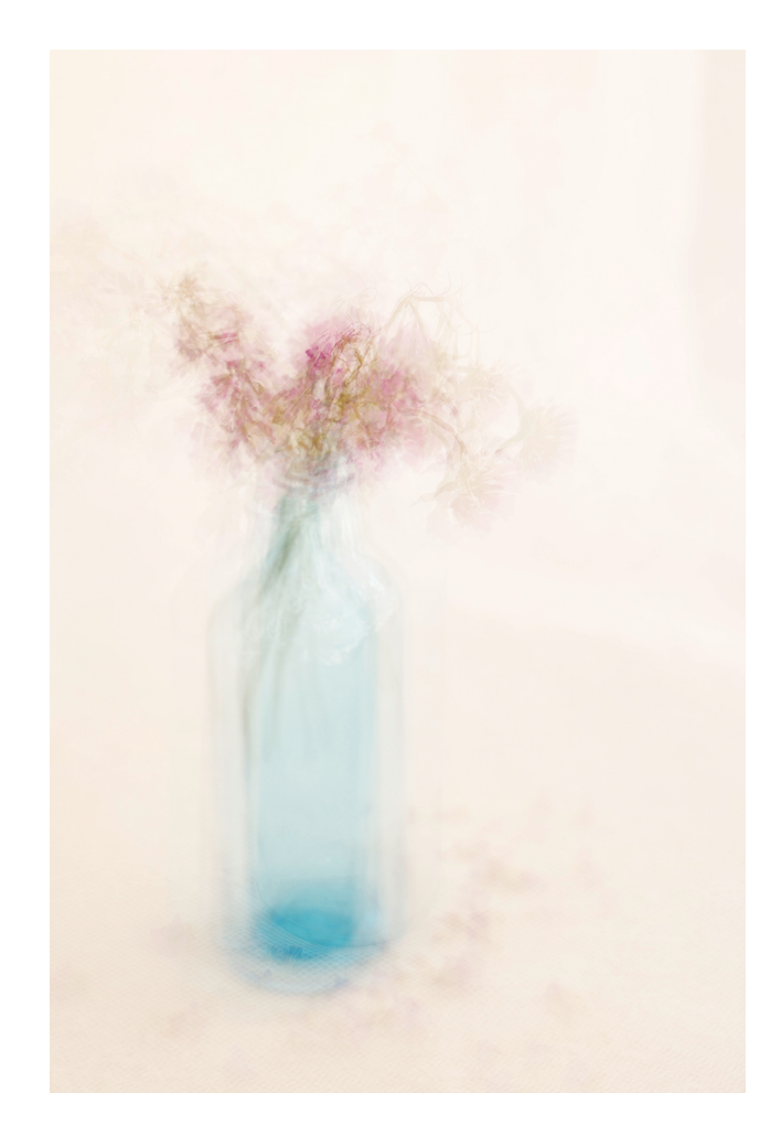
Blue vase Third Elaine Holliday FAPS