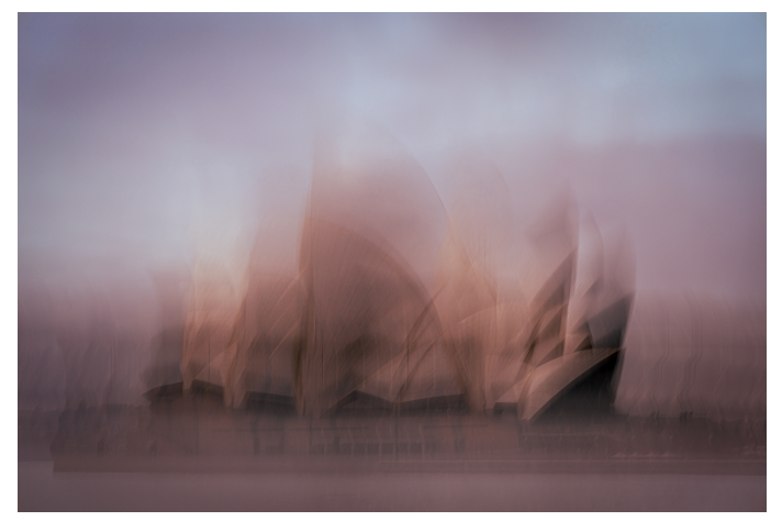
Ths sails in motion Special Mention Elaine Holliday FAPS